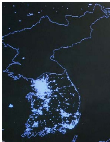
This is a picture of North and South Korea at night. The only city with electric lighting is Pyongyang, where Communist tyrant Kim Jong-un lives.